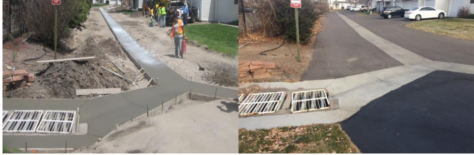
Figure 6: Concrete Company X Project – Town home Drainage System May 2015 (Left), December 2017 (Right)

In May 2015, Company E collaborated with Concrete Company X, a Denver contractor who was interested in evaluating the CNT additive in the expansion of a residential town home community. The evaluation included a new concrete system for