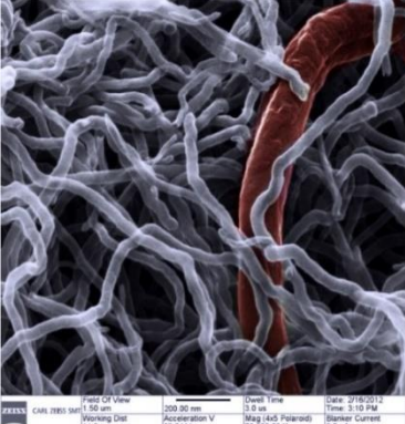
Figure 2: Helium-Ion Microscopy Image Eden Innovations CNT (75,000 x mag)

reinforcement, providing nucleation sites for cement hydration. In figure 2, the cement that has hydrated onto the surface of a carbon nanotube displays a dimpled surface, and shaded red for easier viewing at 75,000 x magnification. The hydration of cement onto the CNTs provides increased strength to the hardened cement paste matrix (Rashad 2). Carbon nanotubes are only 17% the weight of steel, more than 100 - 300 times stronger in tensile capacity than 60 ksi steel, and non-corrosive (Chang et al 3). Like macro fibres, the shape of CNTs help them improve the mechanical performance of concrete, including shrinkage and resistance to crack propagation (Metaxa et al 4). Unlike macro fibres, however, CNTs improve the strength and abrasion resistance of concrete. In many cases, the improved strength provided by CNT additives may allow for a reduction in total cementitious of the mix. Additionally, CNT additives have been shown to improve concrete durability by reducing permeability, which is important in combatting freeze/thaw and reducing scaling from de-icer chemicals placed by the DOT in winter conditions.