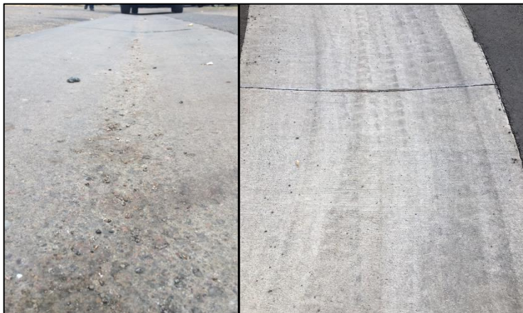
Figure 7: Concrete Company C Project – Town home Drainage (December 2017; 31-months old); Reference (Left) and CNT Additive (Right)

Results from the concrete placed in the field demonstrate a familiar story. Relative to the reference, the sections containing the CNT additive performed significantly better than the reference from the abrasive wear created by water flow and passenger/commercial service vehicles. After 31-months in service, figure 7 shows the reference stained and pitted from de-icer chemicals, also showing signs of deterioration