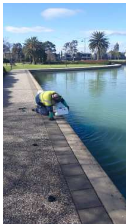
Figure 2: EarthTec Dosing – 15/6/2021