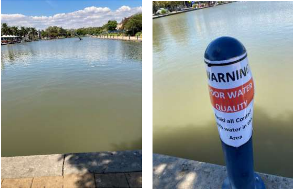
Figure 1: Sir Douglas Mawson Lake (Main Lake) - 12 March 2021