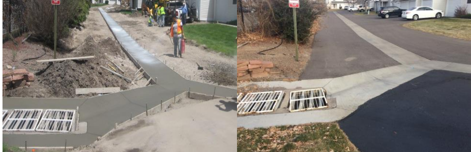
Figure 6: Concrete Company X Project – Town home Drainage System May 2015 (Left), December 2017 (Right)

In May 2015, Company E collaborated with Concrete Company X, a Denver contractor who was interested in evaluating the CNT additive in the expansion of a residential town home community. The evaluation included a new concrete system for