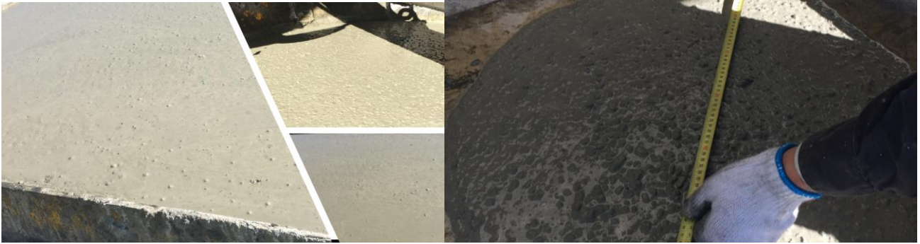
Figure 3: Concrete with CNT admixture, measuring the spread using the slump test.

workability”. “Looks really good, it’s better than the normal stuff”. “It’s visually and physically thicker and not sticky” Refer Figure 3.