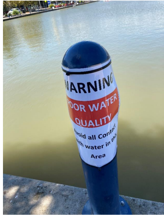
Figure 1: Sir Douglas Mawson Lake (Main Lake) - 12 March 2021