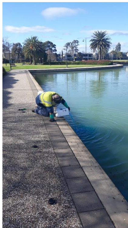
Figure 2: EarthTec Dosing – 15/6/2021