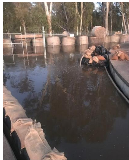
Figure 1. The treated water storages before (left), and during the flood peak (right). The photos above were shared on GVW social media so that the community would have confidence in the town water supply. Misinformation was a common occurrence but the communications team quickly corrected rumours on social media that the town water supply was about to be cut off.