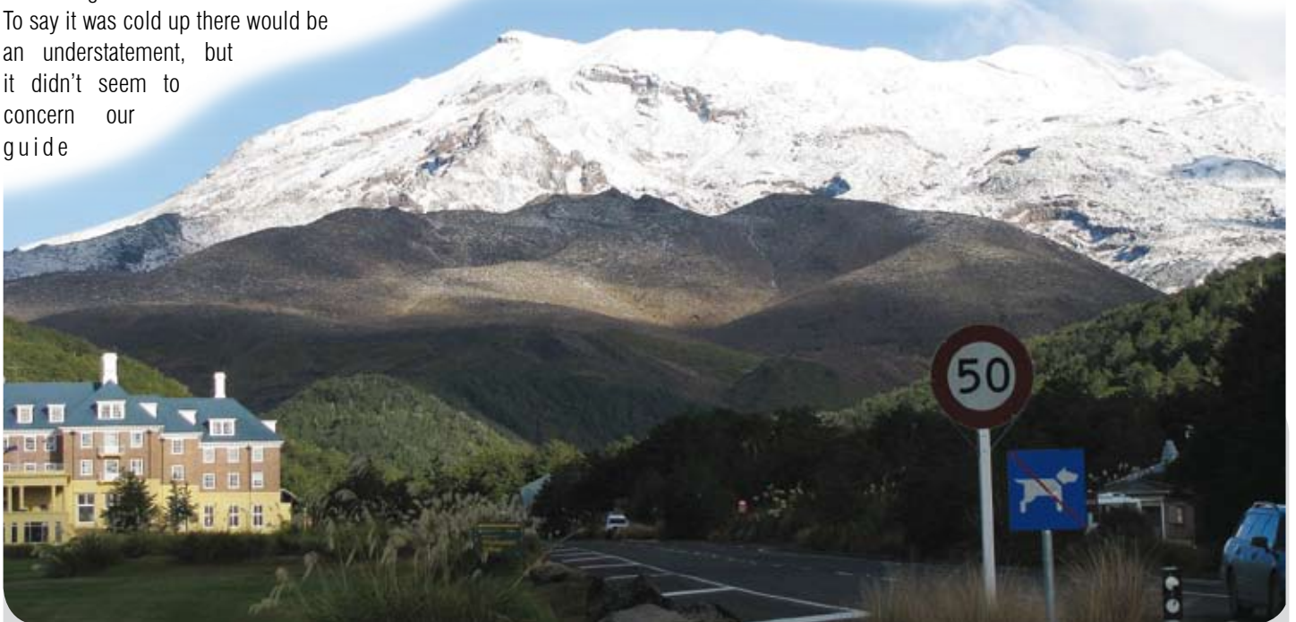
Chateau Tongariro at the foot of Mt Ruapehu - a still active volcano that last erupted in 1995

To say it was cold up there would be an understatement, but it didn't seem to concern our guide