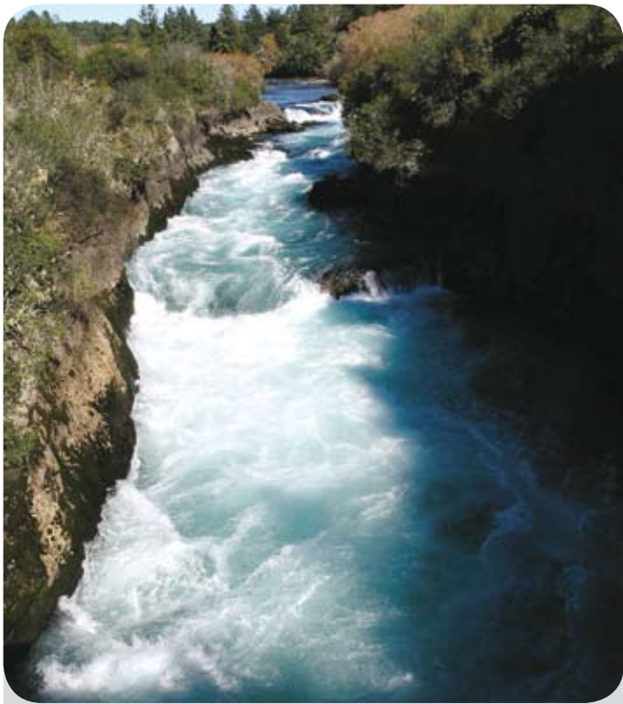
The Huka Falls at Taupo on a 'slow' day \approx 9000 ML/d

mountain scenery. A stop off at the Turangi WWTP to inspect the new membrane plant constructed to replace settling lagoons again showed modern technology employed to treat an age old problem. The journey continued and we kept our eyes glued to the mountain ranges as we had been informed before arriving that Mt Ruapehu was still an active volcano and had just starting to rumble once more. Great! We arrive and headed up the mountain (this is actually where part of Lord of the Rings was filmed) for a lesson in providing water and wastewater services to the Whakapapa Base Area (Chalets and Clubs) at 1700m. Having not seen anything like this, it was hard to comprehend trenching through volcanic rock, flying trenching sand in via helicopter, installing the infrastructure and controlling downhill flows back to the WWTP.