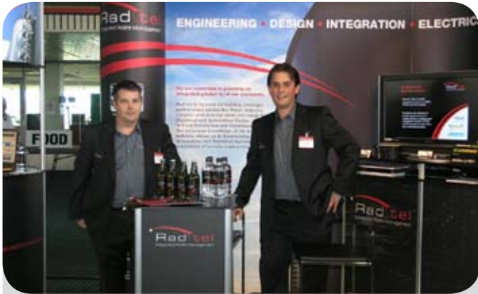
Winner of the best Trade Exhibit at the NSW Conference – Rad-tel Systems

We have had forty-eight different NSW Councils represented at either the Dubbo or Newcastle events, along with reps from sixteen other Water Authorities and nine Government Departments. These two events combined have managed to attract 240 separate delegates and 161 visitors, all of whom now have a taste of what WIOA has to offer. The challenge as we go forward is making sure we get even more Councils represented at the event on an annual basis.