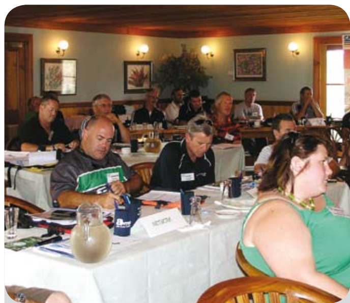
Some of the members at the weekend seminar

An afternoon of activity followed the meeting. There were presentations from operators, demonstrations about valves, there was a very fast car, a decked out truck and more, all followed by a nice spot of wine tasting – the black puma was very well received by the delegates.