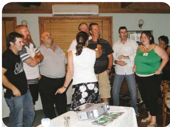
The ‘Virgins’ undertaking the initiation ritual

Then, once again it was time for food – the dinners provided by the resort were sensational and animated dinner conversation was had by all – the presentation of the IDIOTS awards and a strange and unusual initiation of the “virgins” followed. From there we were left to “network”, and network we did, with one brave soul ending up in the spa.