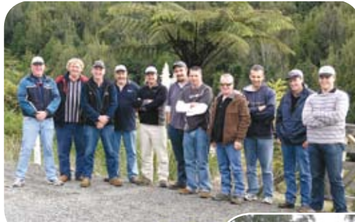
All the Aussie Tourists at the Morrinsville WTP. Read more about the tour - pages 5-7.