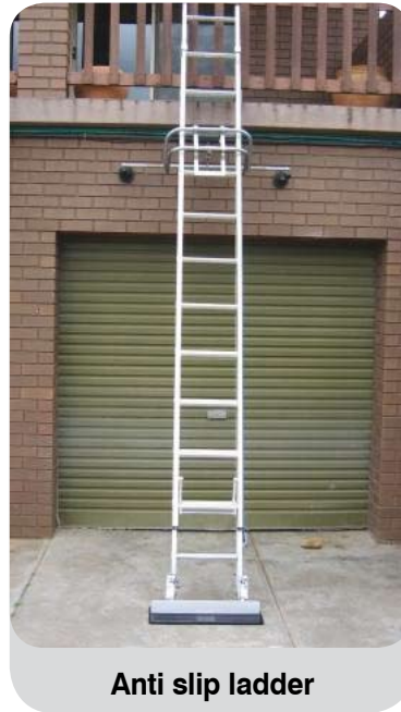
Anti slip ladder

At least 83 Australian have died during the past five years after falling from their ladders and thousands more have been seriously injured 5. The ladder related deaths averages out over the five years to be approximately 16 Australian deaths per year. The UK has a population almost 3 times greater than Australia. So to compare yearly ladder related death figures, Australia should in theory have 3 times less deaths related to ladder falls than the UK. With this theory in mind, in Australia we should on average only have 5 deaths per year related to ladder accidents if we are on par with the UK