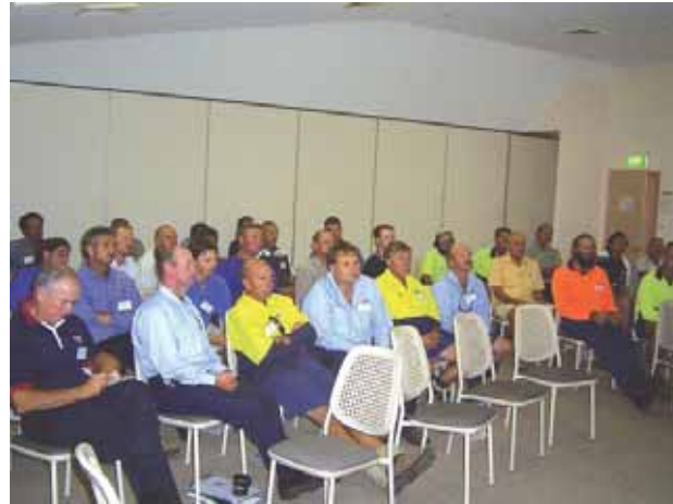
NSW Operators Workshop in Lismore. Details page 4."