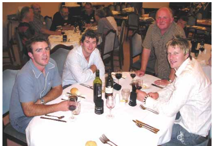
Some committed operators discussing water related issues well into the night