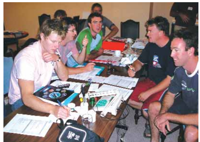
2005 Weekend Seminar at Trawool. See Story page 6.