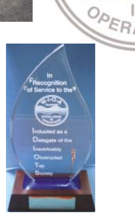
IDIOTS ???- page 5

Newsletter of the WATER MOUSTRY OPERATORS ASSOCIATION OF AUSTRALIA Inc. A12314