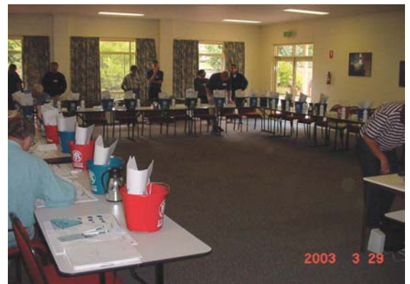
Weekend Seminar set up prior to start of proceedings - see page 6 for report