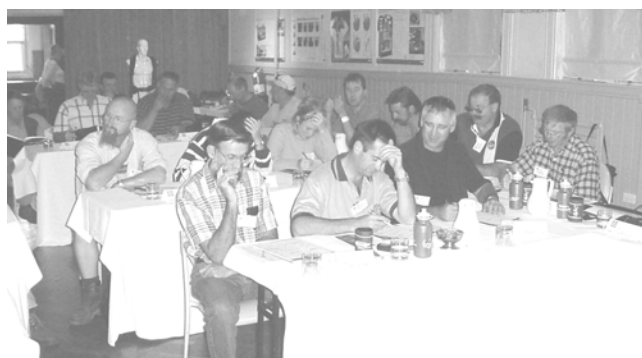
Sunday morning concentration for the 'brain teaser'

The Weekend Seminar dinner was an exceptional event as was the 'networking' that continued well into the evening or was it early Sunday morning?