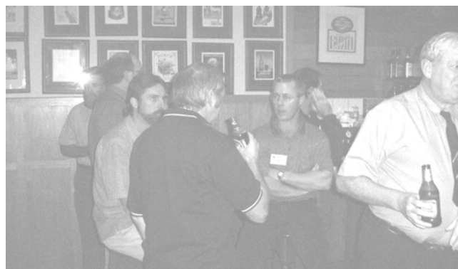
Pre-dinner drinks Saturday evening

At the end of the day and prior to pre-dinner drinks the Special Meeting of the Association was held which has been reported on in the 'Secretary's Scrawl'.