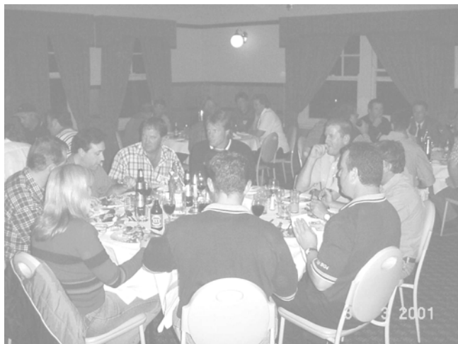
A further group of delegates at the Seminar Dinner

For those of you who didn't have the time (or energy) to venture further up the mountain to The Horn (1723m) you missed a strenuous walk but a magnificent view from this location. It was a fitting end to a great weekend.