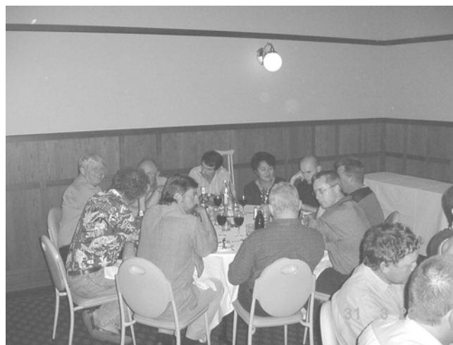
Saturday Dinner at the weekend

For those members who attended the weekend there was a diversity of subjects and products covered and all presentations were well received with many questions being asked. These weekends give members a great opportunity to network with suppliers and fellow colleagues in the industry.