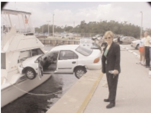
Well it worked in the movie version