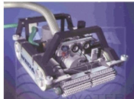
Watch next edition for details of above photo