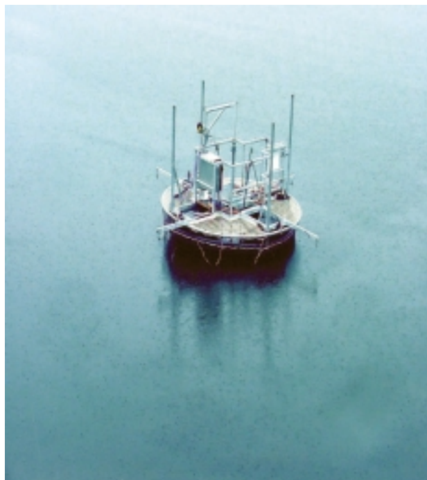
The blue green algae cleaning unit