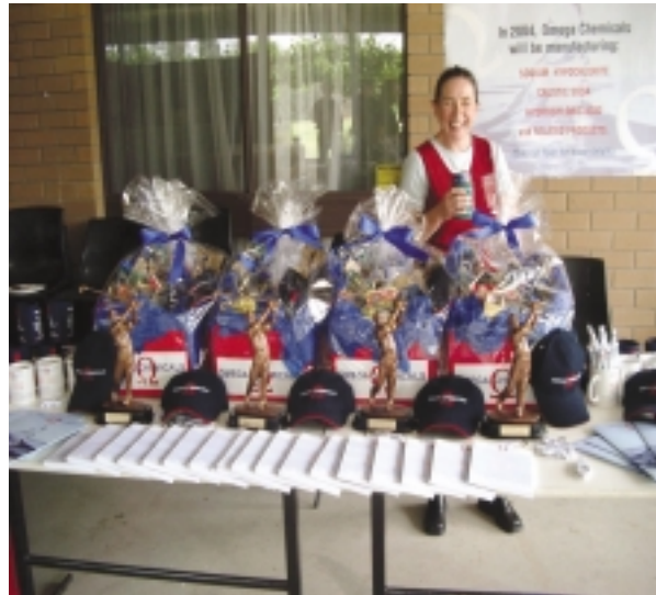
North East Water Golf Day Prizes -See P. 5 for report