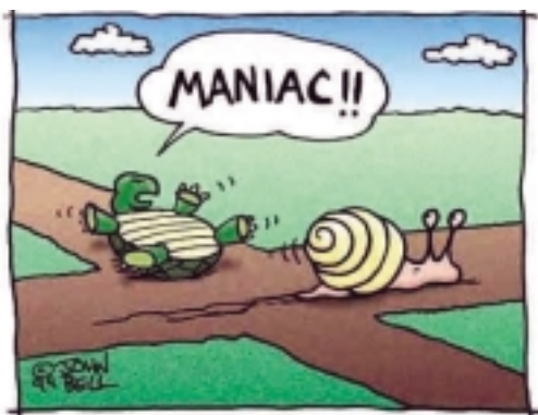
Road rage in the slow lane