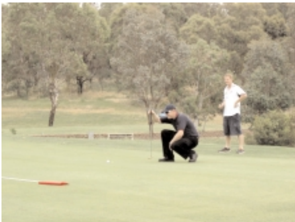
Lining up for that all important putt

The idea of these days is after all to have fun and often lead to the development of new friendships and enhanced working relationships. One thing's for sure "the worst day on the golf course sure beats a day at work".