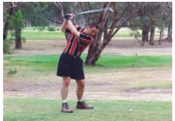
WIOA Charity Golf Day at Trafalgar. See report P. 3