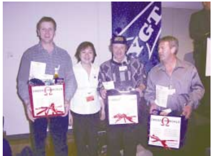
2003 conference competitions winners