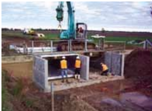
AWMA lowering control gate into position

Articles can be forwarded to area contacts or directly to The Editor email: graham.thomson@barwonwater.vic.gov.au