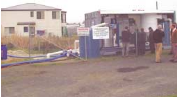
Load-leveling trials at Barwon Water's Ocean Grove site demonstrated that the CDS FSS could manage a max flow of 3MLD for an operating cost of around $0.20 / KL

In more recent times CDS was awarded the largest of 27 grants under Smart Water to demonstrate the application of their unique technology to sewer mining. Based on the process application trialed at Barwon Water Ocean Grove for load-leveling (see Picture 1), CDS demonstrated their ability to produce Class A reclaimed at the very competitive rate of $0.40 / KL (see Picture 2). Reports of the trials are available on request from CDS. Phone (03) 9781 7808