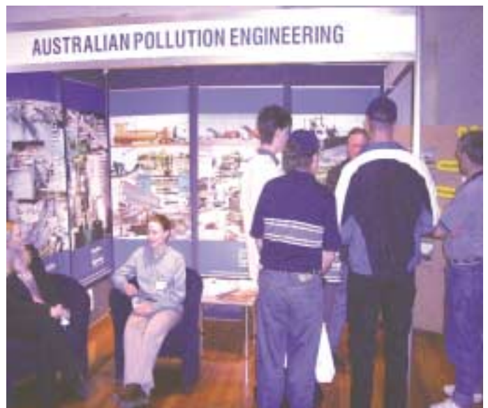
Australian Pollution Engineering display at 2003 conference