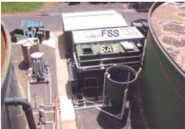
Smart Water Trials at Croydon & Cranbourne demonstrated CDS' ability to produce Class A re-use product for around $0.40 / KL with E.Coli, Turbidity and TSS reduced by over 98.8%, BOD5 reduced by 95.8% and NH4 - N reduced by 49.3%.