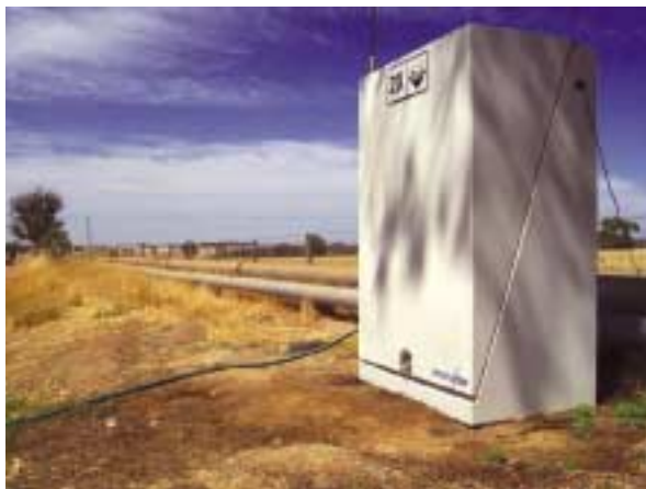
Smartaflow Chlorisafe installation in rural WA

However, WA company Smartaflow - exhibitors at this year's WIOA Engineers and Operators Conference - believe they have the answer. The company has recently opened a Victorian office and specialise in providing turnkey hypochlorite dosing systems that not only provide an accurate, safe and reliable means of treating drinking water, but radically reduce the total cost of chlorination.