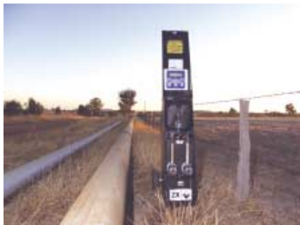
Below Smartaflow Portachlor.