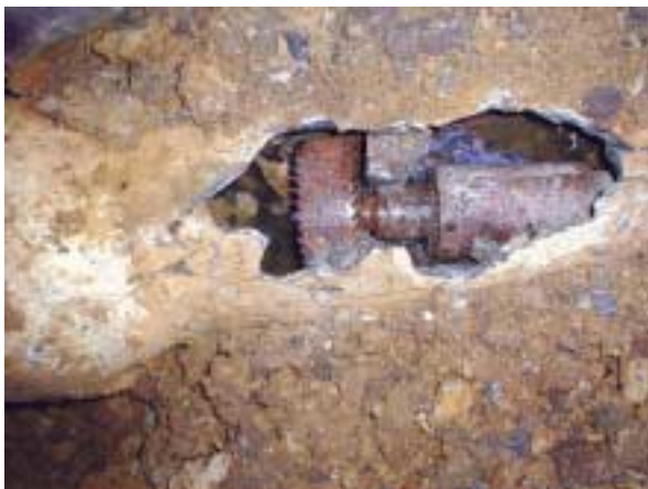
What you don't want - a root cutter stuck in a sewer

'OPERATOR' is printed by Barwon Region Water Authority. The WIOA gratefully acknowledges the support provided by Barwon Water in producing 'Operator'