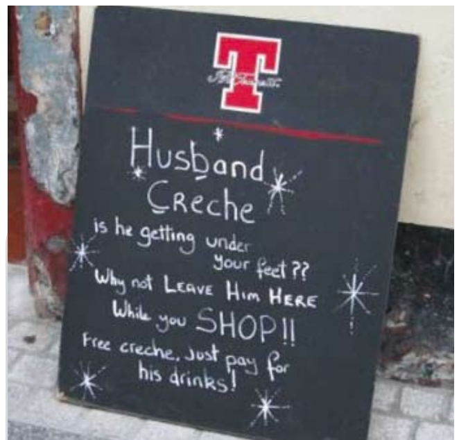
Best ever pub sign