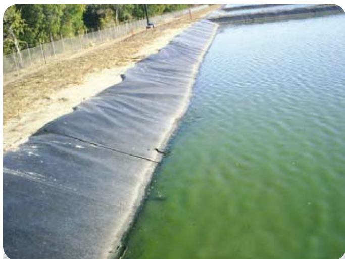
Water Park Pormpuraaw style

We operate a small water plant that supplies over half a million litres of treated water a day, with our raw source being bores and our waste water system consists of two pump wells and five lagoons ( were not big ).