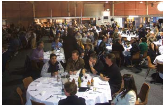
Hamming it up at the Victorian Conference Dinner. Read more on page 3