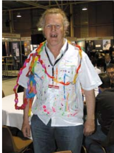
What IDIOT would wear a shirt like this? Find out on Page 8