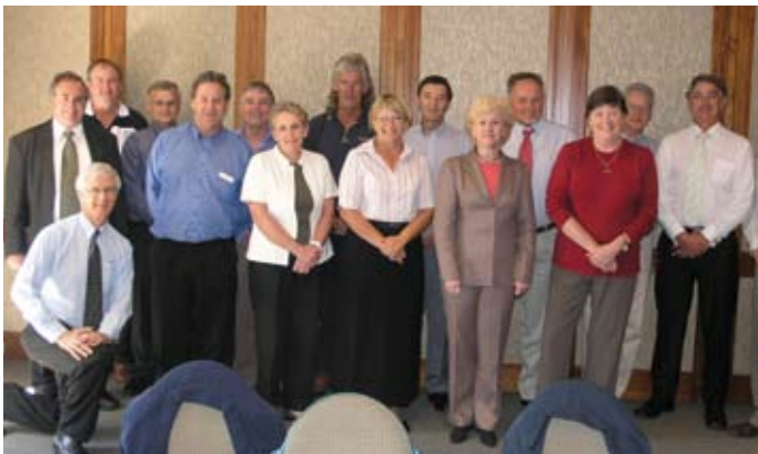
Water Training Committee Signing off the revised Package

The Water Industry responded generously to the project development teams call for technical input. This industry feedback assisted the technical writing team greatly in the development of the end product - an enhanced/updated Water Industry Training Package.