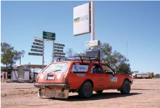
Car 77 Back on the road again

But it was nothing the true rally spirit could not overcome. In fact you couldn't have got it fixed quicker if you were Paris Hilton with a wardrobe malfunction. The first bloke knew a bloke in Colleambally who might be able to help, and that bloke knew a bloke in Griffith who might be able to help. And before we knew it the absolute legends at Riverina Automatics were sending us to the pub while they fixed the car. It was, of course, a simple fix if you think pulling the auto out, pulling it apart and putting it all back again is simple.