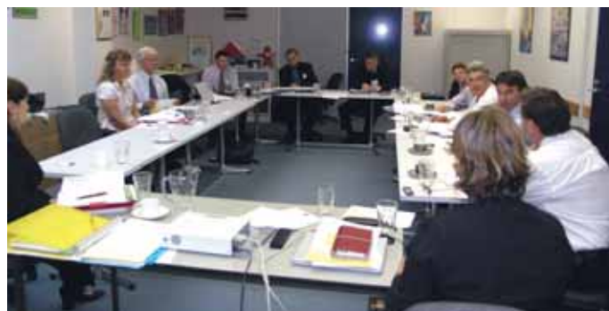
Training Package Review Steering Committee meeting recently

If you have any queries about the process or concerns with