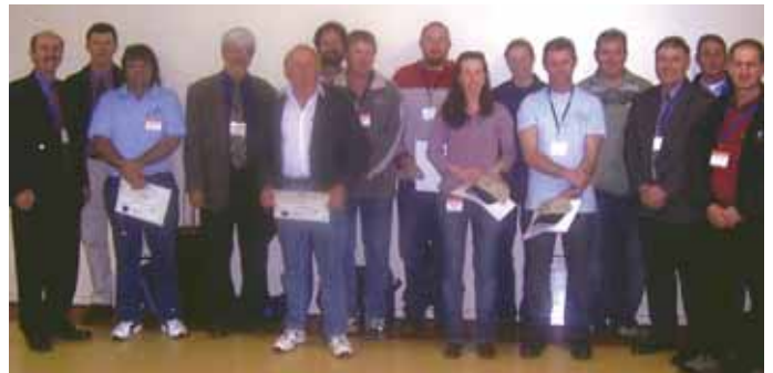
Some Certificate recipients and their trainers at the Victorian Conference