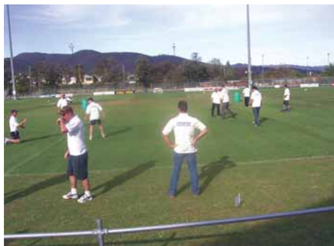
The teams limbering up for action

The first day ended with a late afternoon "country" V's "city" cricket match with some very dubious umpiring provided by Michael Seller from AWA. Still sporting my crook back, I was thrown the pen and the scoring responsibilities. True to form at one of these games, and with no fudging by the scorer, the result was a tie. This was courtesy of the last batting pair losing 20 runs in the last of their 4 overs (indoor cricket rules used where you lose 5 runs every time you go out).