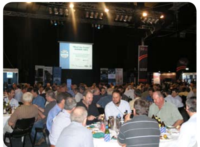
Sharing a meal and networking during Wednesday's "Meet The Trade Dinner"