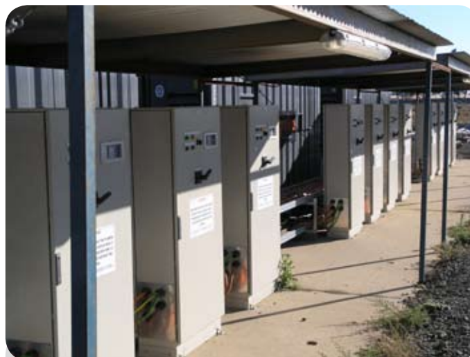
Major Pumping Station control systems.