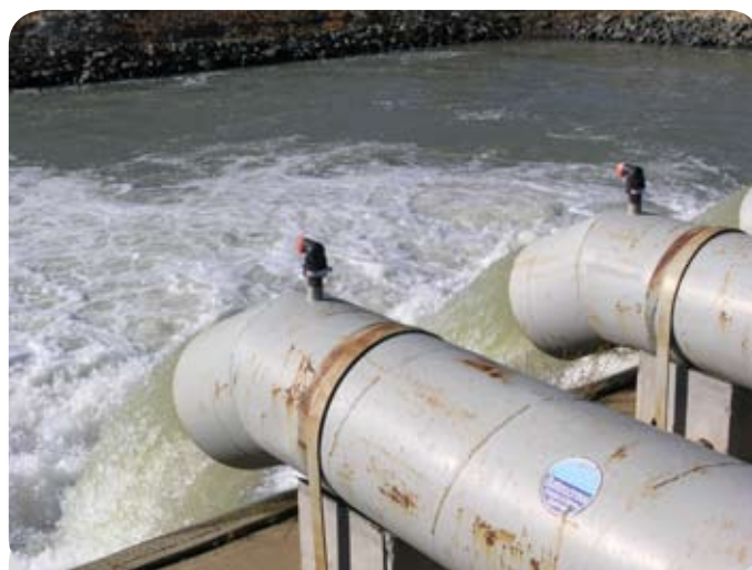
Discharge from the pumps.