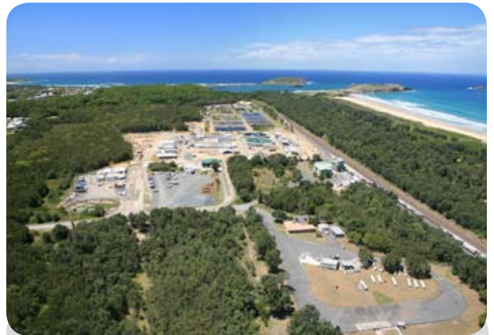
Aerial view of the Coffs Harbour Water Reclamation Plant.

The project was delivered under an Alliance between Coffs Harbour Council, Abigroup and John Holland Water and sub Alliance partners GH&D CNF&A and Aquatec Maxcon. I am still wading through 36 gigs of pics. I'll send you more when get them sorted."