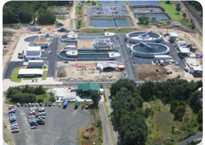
Construction works at the Coffs Harbour Water Reclamation Plant