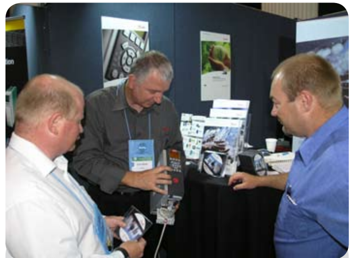
Product demonstrations at the NSW Conference.

Manager Operations Water Byron Shire Council