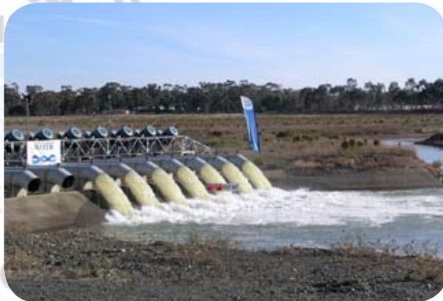
Waranga Basin Major Pumping Station. Read more on page 11.