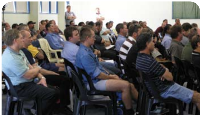
"Delegates listening to the papers"

The technical paper sessions were better attended than normal probably due to the air conditioning in the papers room which was considerably cooler than the exhibition hall. The papers presented were of an excellent standard and many speakers issued challenges to us all to consider the implementation of a new or improved system to enhance our operational efficiency.