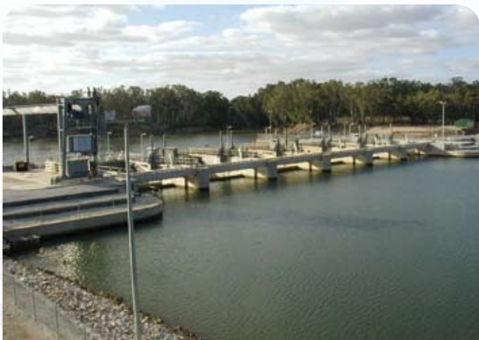
"The new Torrumbarry Weir looking from upstream"