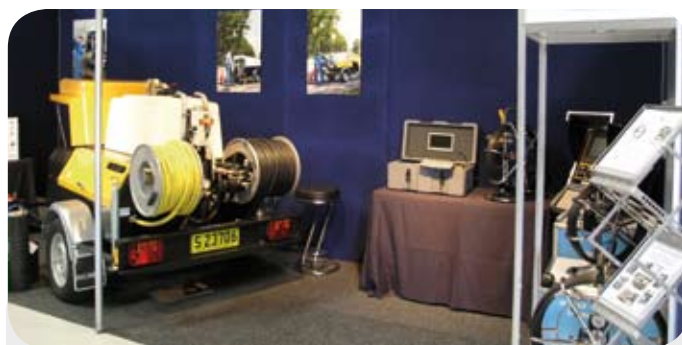
"Joint Winner of Best Exhibit – KRE Engineering"