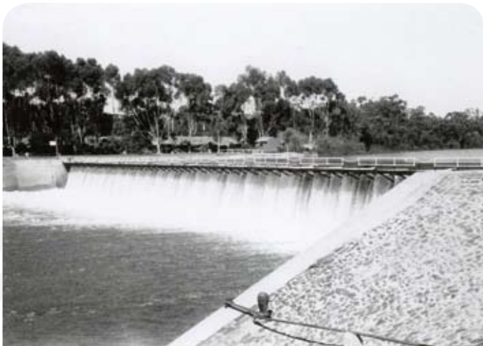
"The old Torrumbarry Weir looking from downstream"

The new weir is fully automated and regulates its flows based upon a preset upstream level which it will maintain to within 5mm of that level. At full supply we have a weir pool that holds 36,820 ML. Torrumbarry Weirs main purpose today is to supply irrigation water to the Torrumbarry Irrigation System which stems as far as north of Swan Hill approximately 170 km away. The new weir was built to incorporate the original lock which is still in use today.