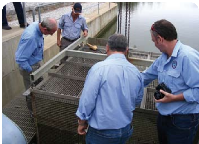
"Raising the fish trap at the end of the ladder"

During the tour everyone was informed about the Fish Ladder, the new weir and its construction and also the old weir on how it operated and how it failed. The old steam winch and boiler that is still in operating order was one of the highlights of the tour as well as the big nest of paper wasps.