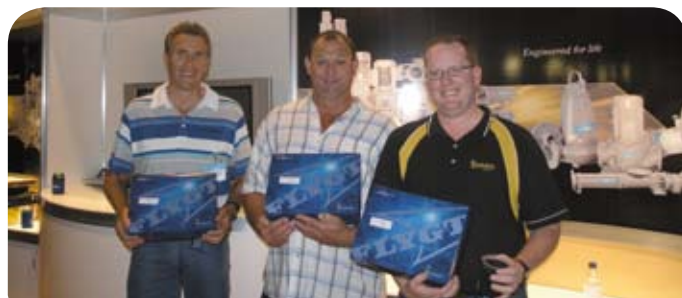
"Some of the winners of the Trade Competition with their goodies"

Congratulations to all the winners of the Trade Competition, thanks to ITT Flygt for being the major sponsor of the Competition, thanks to Tolsh for organising it and thanks to all the companies who donated products to go into the other prize packs.