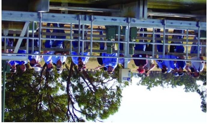
Control gates at Deniliquin

Day one: The event started with breakfast at Cohuna, the base and location of AWMA's manufacturing facility. There were approximately 30 attendees from all areas of the water industry, including suppliers and customers. AWMA planned a trip leaving from Cohuna to Koondrook, Deniliquin, Moama, Rochester, Tatura and back to Cohuna again. It didn't seem possible to cover such a large area and still have time to smell the roses but AWMA managed it beautifully. The first stop was a look at one of AWMA's first regulators at Koondrook weir. We then moved onto Deniliquin where we visited a rice grower using 300-400ML/day. Then onto Woondrook road regulator just outside of Deniliquin where AWMA are installing remote monitoring and control sites for Murray Irrigation.