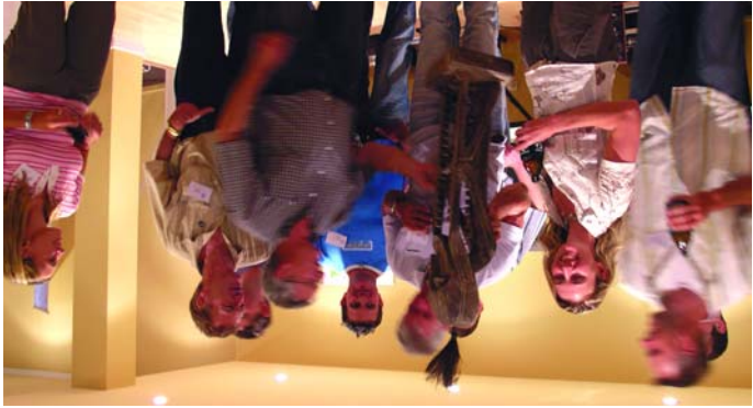
Who are these Members and what are they holding see page 7