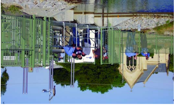
Cohuna Weir – Can you spot what's on the antenna!

Day two: Breakfast at the Cohuna weir and off take.