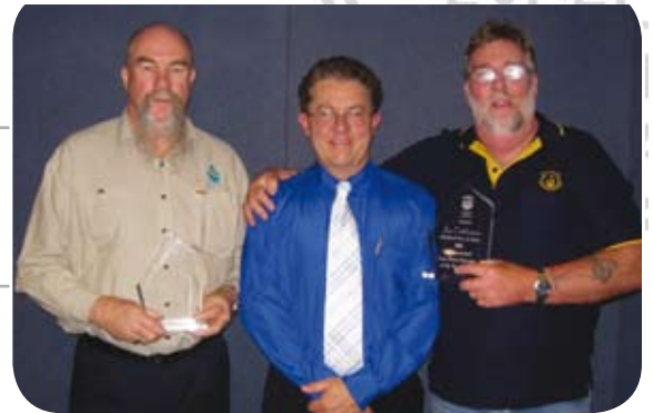
Qld "Operators of the Year" 2008. Read all about them on page 7