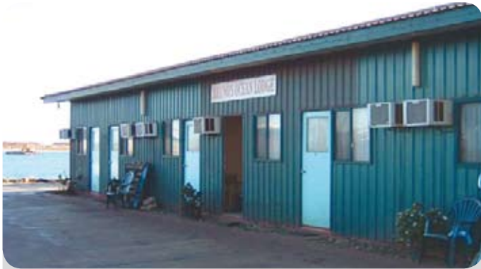
Dongle at rear - my room, extreme left (top security - spare keys for each room kept in an open meter box at all times) I used a chair wedged against the door for extra security at night.

The owner/manager was not on site when I arrived - I was helped by one of the Lodge's occupants.