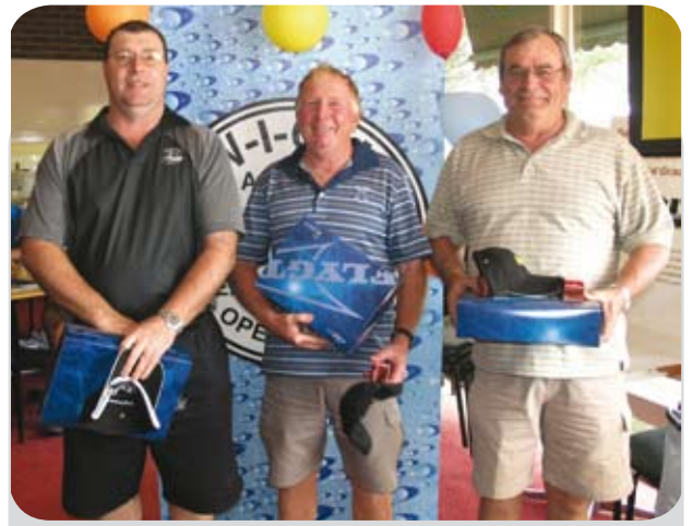
Golf day - Runners up - North East Water Team