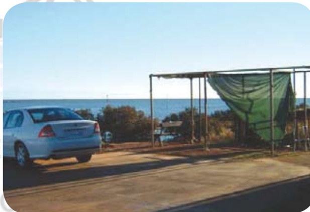
Luxury Gazebo at Brunos Ocean Lodge in WA. More on page 5