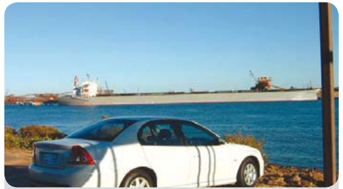
The ore carrier that woke me on Friday morning around 1.00 am at high tide as it was manoeuvred by tugs out of port - sounded like the tugs were in my room.

I believe that it has now been bulldozed out of existence.