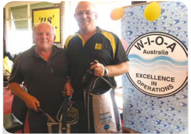
Golf day - Winners of the 10th birthday surprise packs