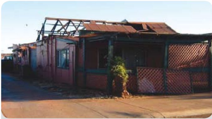
Street view of Brunos lodge

It was after sunset when I arrived and I could not find any premises with the name Bruno's Ocean Lodge (very dark, no lights and no signage). I needed help from the barmaids at the local pub to point me in the right direction. In fact, I had passed the premises three times and did not recognise it as a place fit for human habitation (at least not from the street front view).