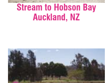
Recycled water for