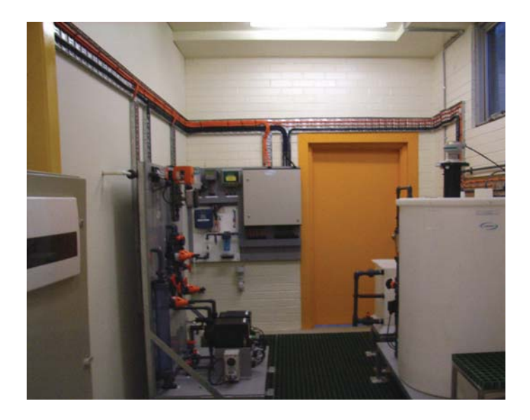
Morwell Water Treatment Plant Fluoride Room

Currently GW have four plants up and running, Morwell and Warragul, Sale and Moe with Traralgon not far away. There have been some small hiccups along the way but we working through those issues and are confident that we have made the right choice.