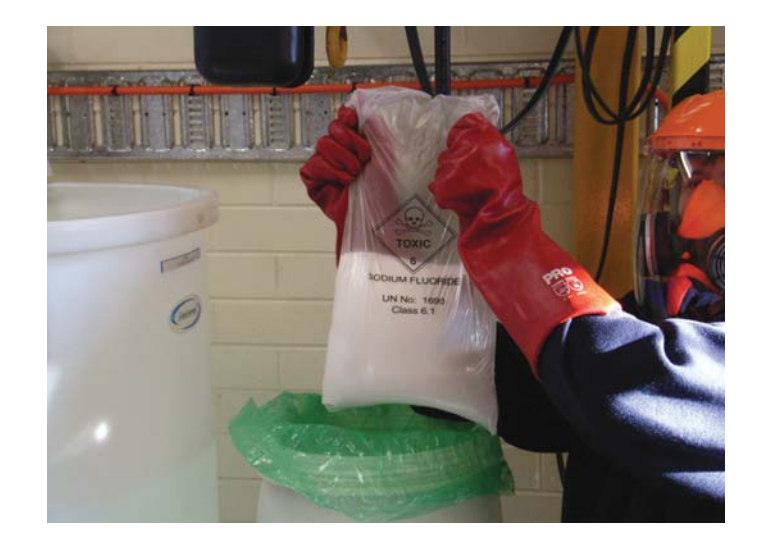
Loading 5kg bags of Sodium Fluoride into the saturation tank