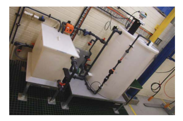
Saturation and Dosing Tanks