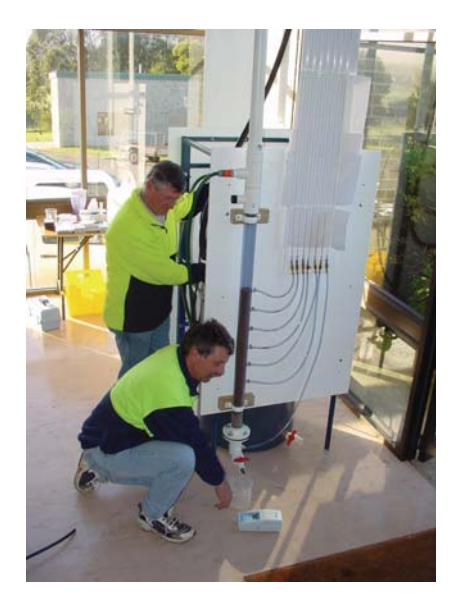
The W.I.T.C Pilot filter rig in action

Trainees ran the rig under simulated full scale conditions and recorded the progress of various performance parameters such as flow, headloss and turbidity. The rig provides an excellent practical demonstration of how granular media filters behave and its development reflects the Training Centre's continued commitment to the provision of quality training to water industry personnel.