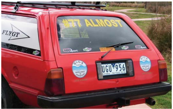
WIOA, Flygt and EGL sponsored car in the Cystic Fibrosis rally

Stay tuned for future instalments of this heart-warming story. Also, if you have any ideas or can offer your support, contact Craig on (02) 6022 0594.