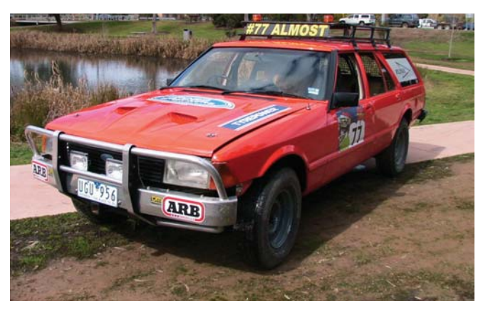
What is the story behind this car and where is it going?? Read more on Page 7

Newsletter of the WATER INDUSTRY OPERATORS ASSOCIATION OF AUSTRALIA Inc. A12314