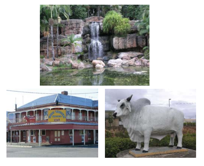
Find the common thread...... the answer is on page 6

If you solved the puzzle then you will know what I am referring to in the following paragraph.