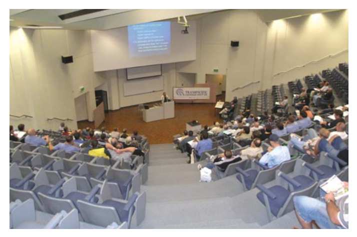
The papers room at Qld – if only we could take it all around the country

The technical paper sessions were well attended and we definitely enjoyed the luxury of the massive lecture theatre at the Uni Complex .